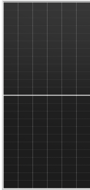
Figure 1 LONGi PV module