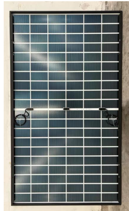
Fig. 2: Rear view of test sample