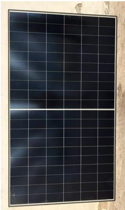
Fig. 1: Front view of test sample