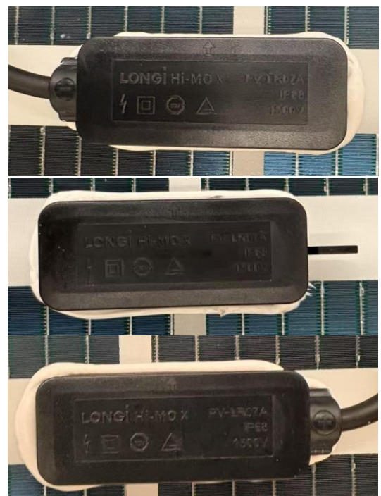
Fig. 4: Detail view of closed junction box