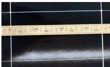
Fig. 3: Detail view of solar cell